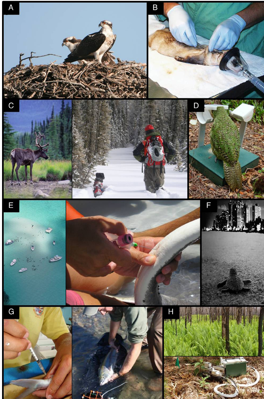
Figure 1: Conservation physiology successes cover a diversity of taxa, ecosystems, landscape scales and physiological systems. For example: (A) Birds of prey, such as osprey, have rebounded following regulations on DDT. (B) Plague is being combated in the endangered black-footed ferret via a targeted vaccination programme. (C) Caribou and wolf populations are being effectively managed via physiological monitoring of scat. In the right photo, a scat detection dog locates samples for subsequent physiological processing. (D) Nutrition programmes support successful breeding in the critically endangered kakapo. (E) Ecotourism feeding practices are regulated for stingrays in the Cayman Islands. In the right photo, a blood sample is obtained from the underside of the tail to monitor multiple physiological traits. (F) Sensory physiology has informed shoreline lighting regulations for nesting sea turtles. (G) Physiological monitoring of incidentally-captured fishes can be accomplished through blood sampling (left photo), and recovery chambers have been designed that decrease the stress associated with by-catch in salmonids (right photo). (H) Physiological studies have identified native species that tolerate fire caused by exotic species (top panel) and recruit under low light conditions in heavily invaded forests (bottom panel) in Hawaii Volcanoes National Park.