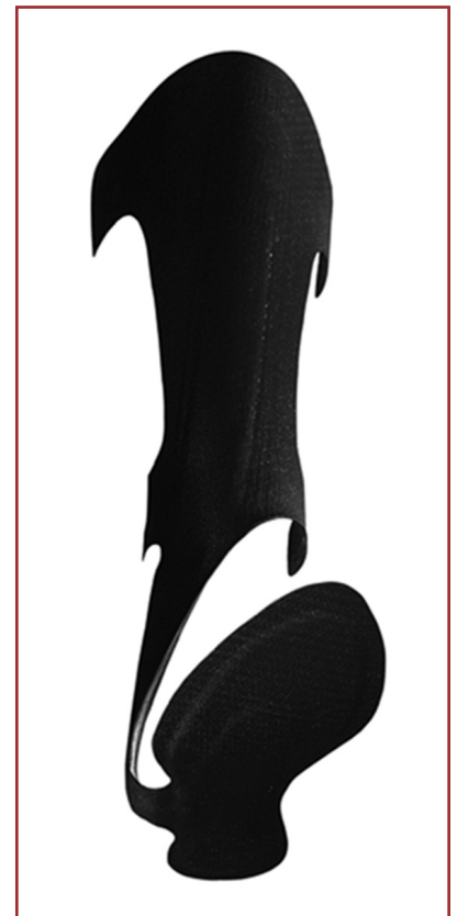
Figure 3. Kinetic return ankle foot orthosis.

The data suggest that use of a KRAFO may engage the calf muscles during physical activity. The slight but statistically significant increase in mean calf size observed over the eight-week period is very encouraging, especially considering that muscle hypertrophy does not begin until at least