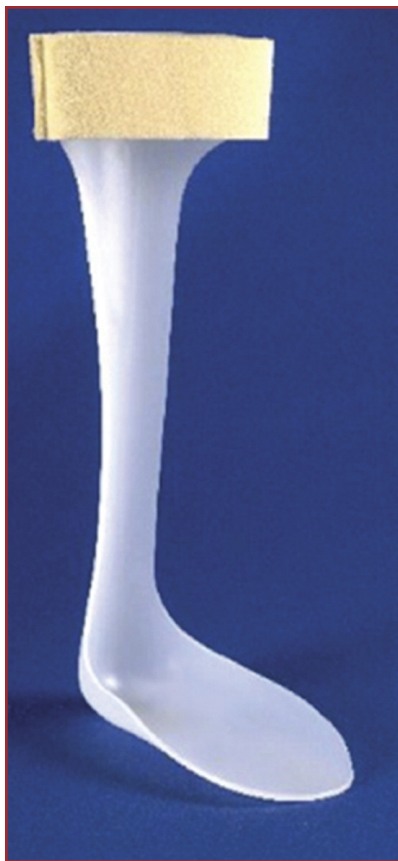
Figure 2. Solid ankle molded ankle foot orthosis.

data was compared with the first set and analyzed using a paired samples T-test.