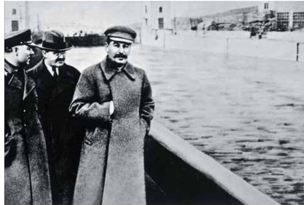
FIG. 2 -3 Left and above: Stalin with Voroshilov, Molotov, and Ezhov, before and after the latter's removal from his post as People's Commissar for Internal Affairs (NKVD) in December 1938.

However, Stalin had already consolidated power in his hands during the lengthy period of illness prior to Lenin's death, and so the letter was never made public to the Soviet people. Instead, he set about making sure that the myth of his great friendship with, and love for, Lenin were monumentalized in propaganda.