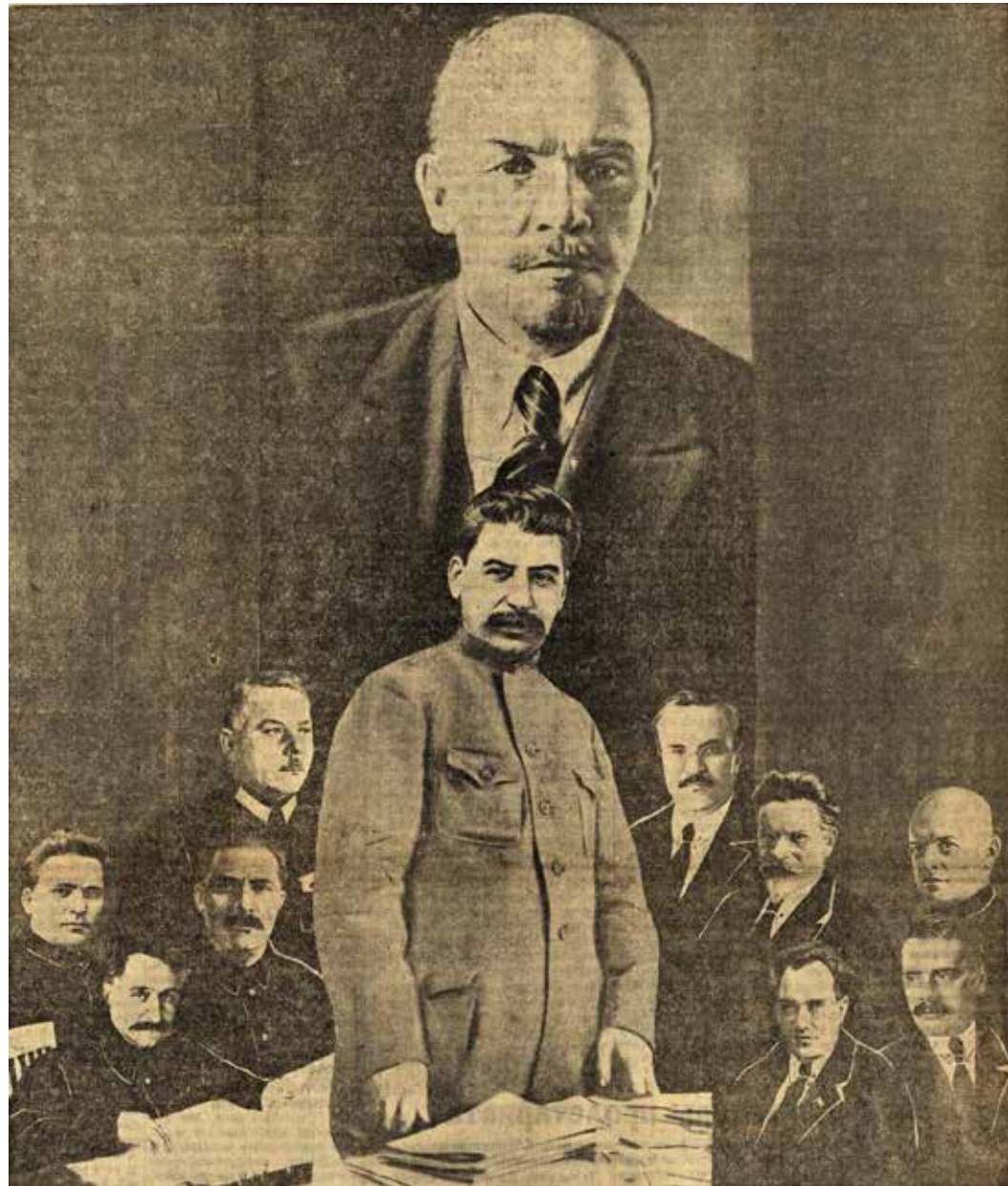
FIG. 1 Photomontage by N. Dologorukov from Krasnaia zvezda , 30 July 1933, celebrating the 30th anniversary of the Bolshevik Party. Stalin stands at the pinnacle of power beneath Lenin's disembodied gaze.