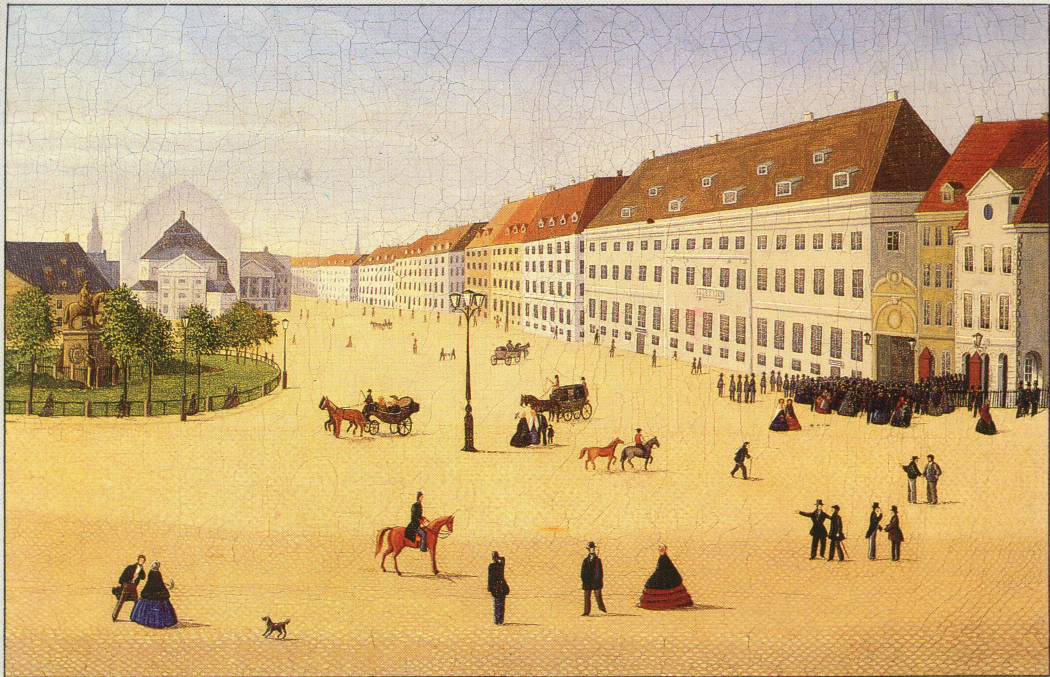
Hotel d'Angleterre Est. 1755