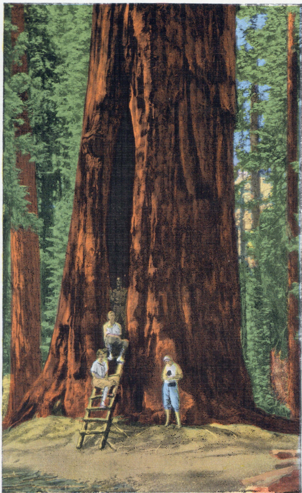
10. THE ROOM TREE, GIANT FOREST