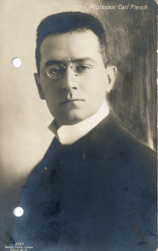
Professor Carl Flesch