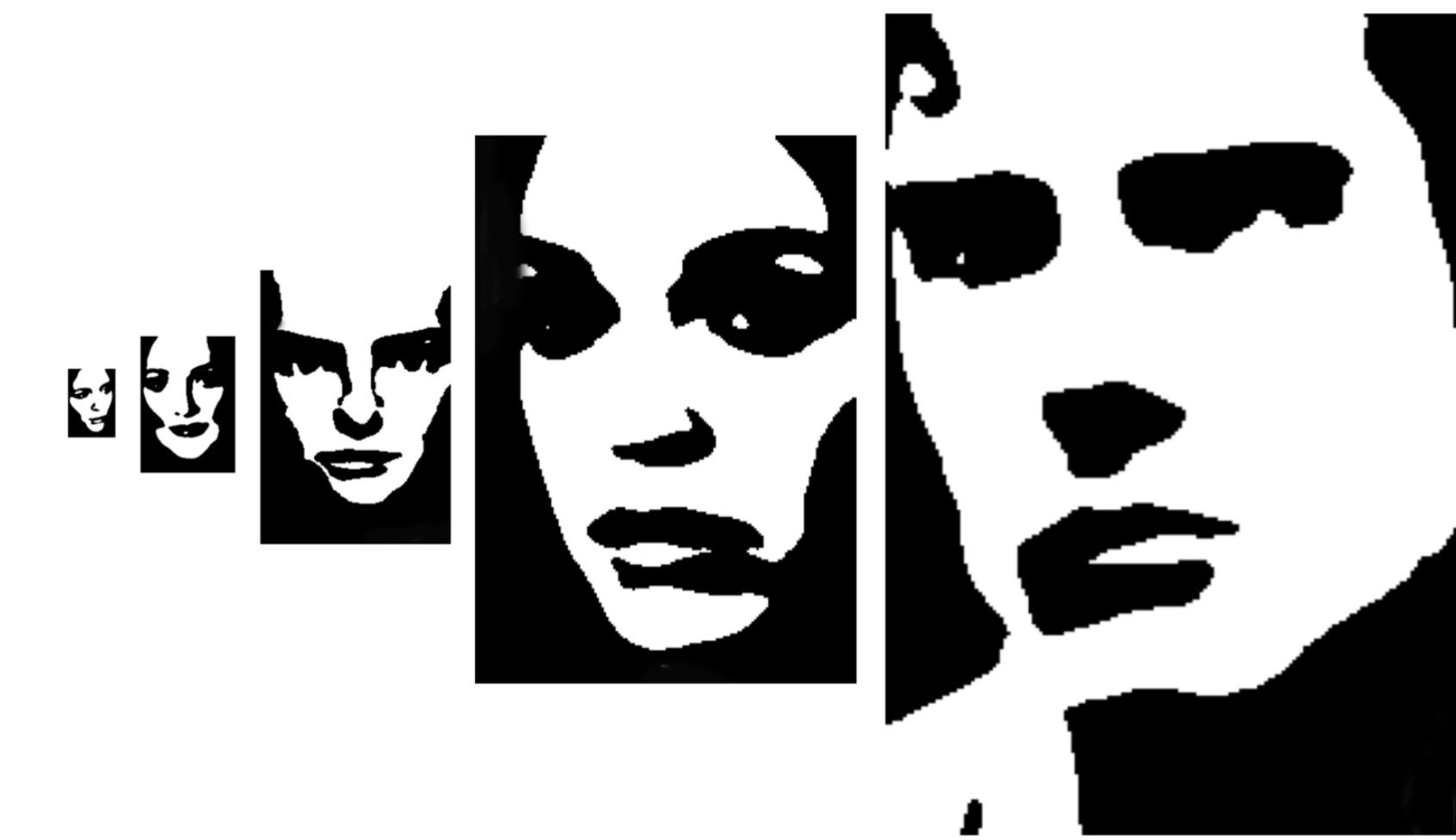
Figure 3: Example of Mooney faces at different sizes.