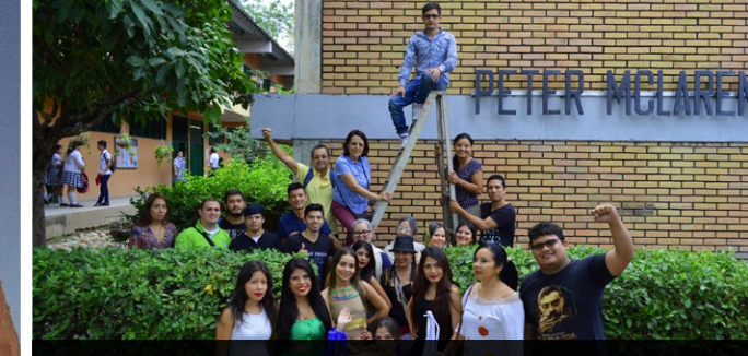
Students standing outside a school building named after Peter McLaren on the campus of La Escuela Normal Superior de Neiva, in Colombia.