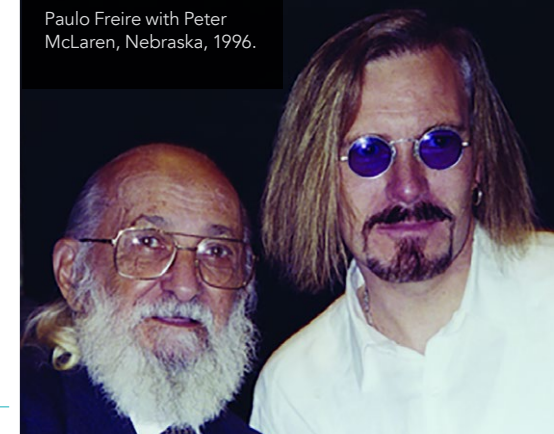
Paulo Freire with Peter McLaren, Nebraska, 1996.

A problem-posing model of education can lead to critical consciousness resulting from a dialogical engagement about the manifold complexities of students' lives and lived experiences.