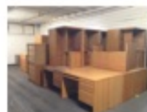
Figure 1. Furniture storage facility.