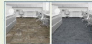
Figure 3: Examples of carpet tiles from Interface that wouldn't show fading