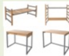
Figure 2: Examples from the Metropolitan series at Sustainable Furniture Inc.