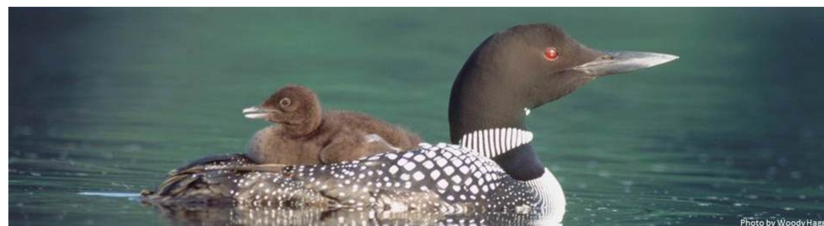
Fig. 1 A loon with its chick. Loons remain in close proximity to their chicks especially during the first few weeks when the chicks cannot dive efficiently to escape predators and feed for themselves.

Our objectives were to investigate tameness by measuring FID in common loons. Specifically we determined whether tameness was similar between parents and offspring and whether it was influenced by breeding stage.