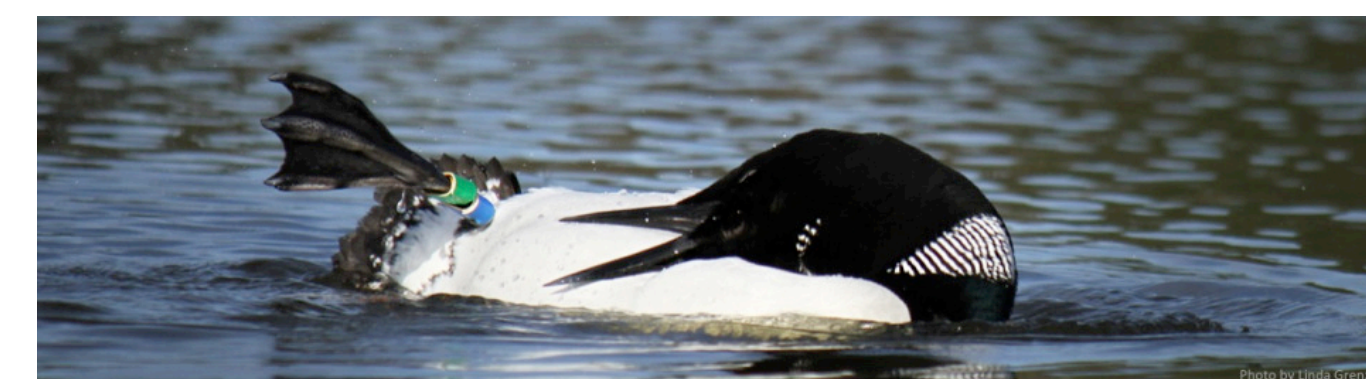
Fig. 3 A preening loon with its colored bands visible.

Weekly observations between April-August every summer from 2014-2016 provided us with the four leg band combinations of territorial pairs on each lake. Tameness was measured on loons as part of the weekly observations when a loon was preening, resting or locomoting and at least 50m from any conspecifics.