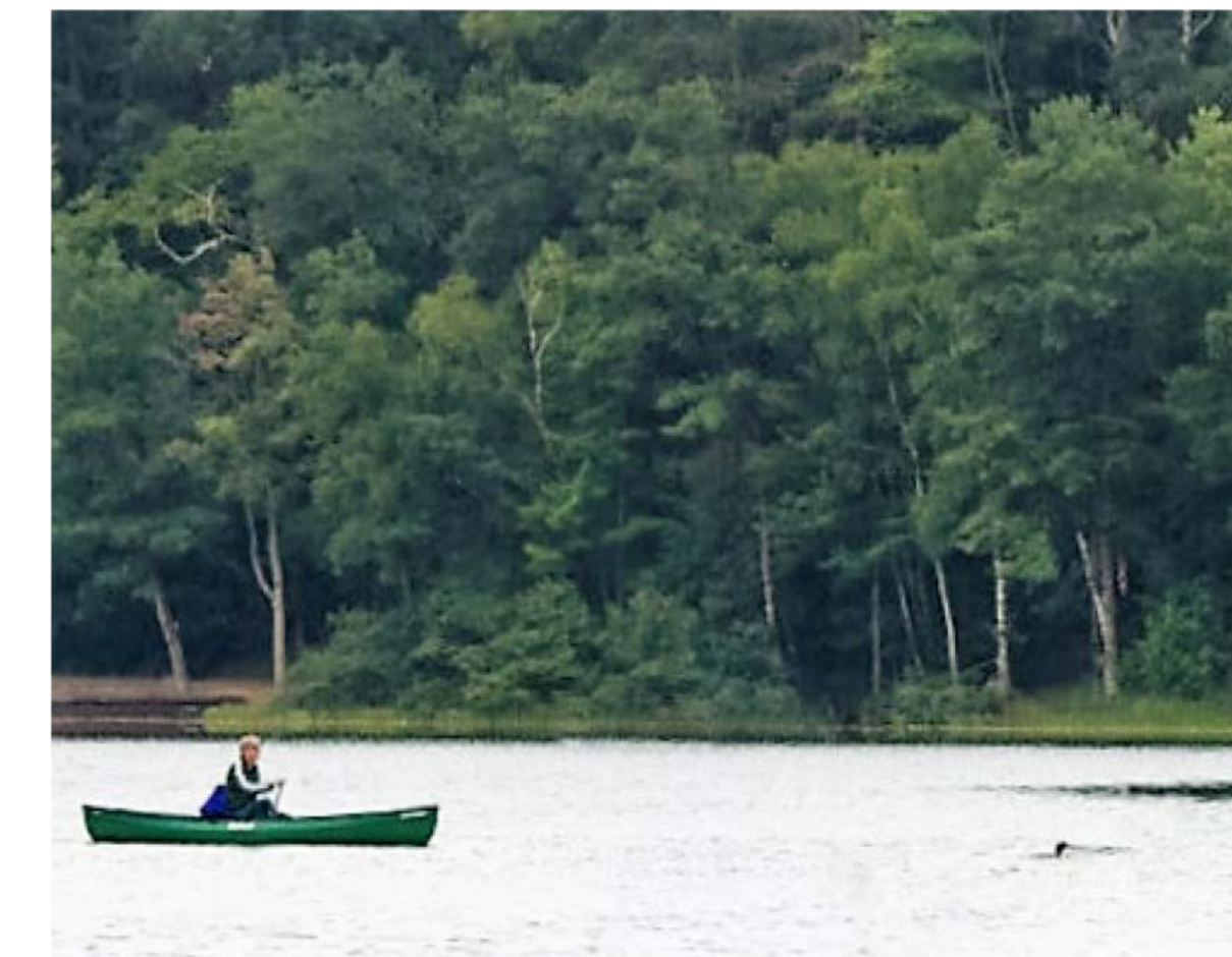
Fig. 2 An observer approaching a loon.