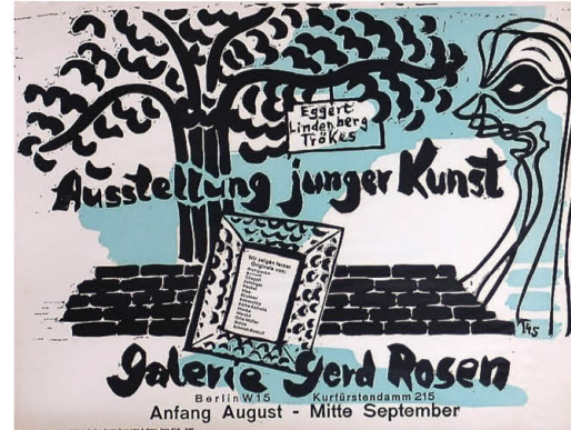
Poster of the exhibition Junge Kunst (Young Art), Galerie Rosen, Berlin