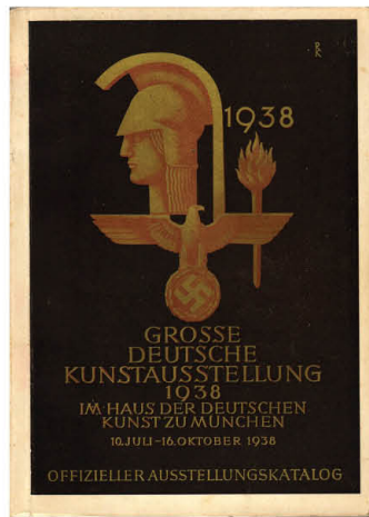
Great Exhibition of German Art, catalogue cover, 1938

"The art put on display marked a cultural shift towards freedom of expression in the arts that the people of Germany had been denied during Nazi rule."