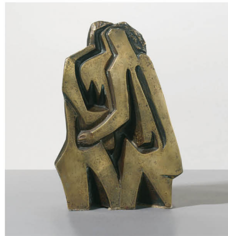
Hans Uhlmann, Weibliche Gruppe, 1947

The Galerie Gerd Rosen, in its attempts to display modern art, exhibited the works of artists such as Hannah Höch and Hans Uhlmann. Both of these artists were at the forefront of reestablishing a thriving German art scene in Berlin, and creating works that marked a major movement towards the avant-garde. Before the war, Höch was best known for