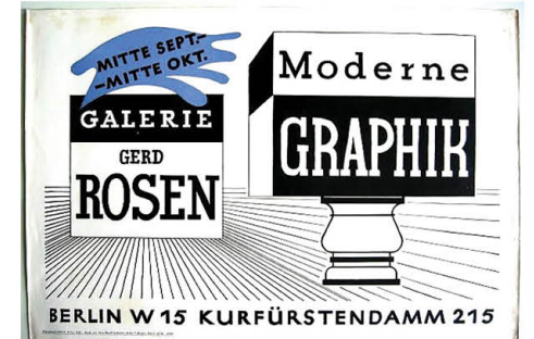
Poster of the exhibition Moderne Graphik (Modern Graphic), Galerie Gerd Rosen, Berlin, 1945