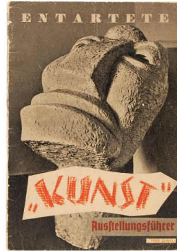
Entartete Kunst (Degenerate Art) exhibition, catalogue cover, 1937

From 1937 until 1945 in Germany, Hitler and his associates carefully censored the art that was able to be viewed by the public. Hitler believed that true beauty could be found in Greek classicism, and in 1937 he instated laws that demanded all art produced in Germany should embody the proportion and unity found in classical Greek art. Modern art was marked as "degenerate," meaning that until the end of the war, Expressionist, Dada, Surrealist, Cubist, and Fauvist art was all banned. Hitler took great care to associate himself with the classical Greek aesthetic, first by holding a Great German Art Exhibition in 1937-1938 that showcased large classical sculptures of the male form. In contrast, the Entartete Kunst (Degenerate Art) exhibition of 1937 displayed over 650 works that were categorized as markers of social decline. This show was carefully coordinated by the Reich Propaganda Directorate with the purpose of convincing the public that such art had infected their population, and needed to be totally censored.