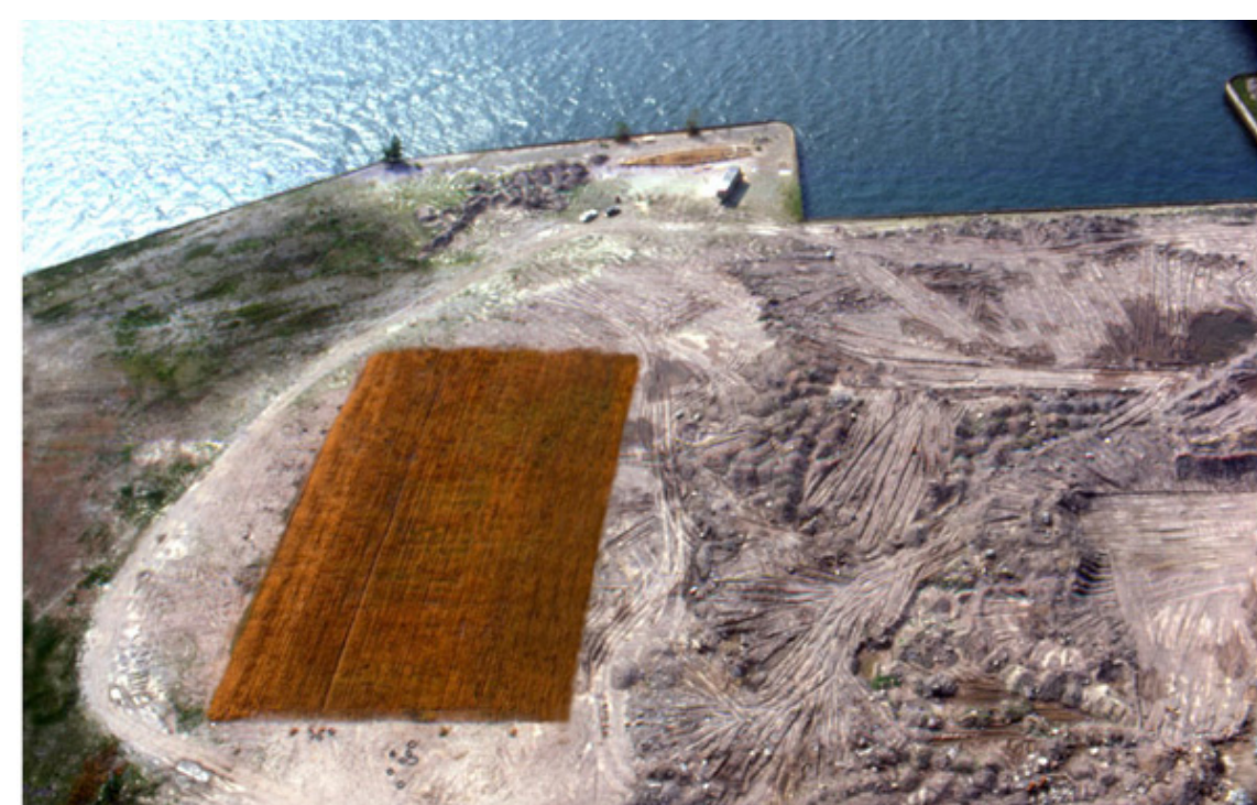
Agnes Denes Wheatfield - A Confrontation (Battery Park Landfill, Downtown Manhattan) © 1982 Agnes Denes

Nature vs. Artifice: In 1982, New York artist Agnes Denes completed her piece 'Wheatfield – A Confrontation' which was grown on the Battery Park Landfill, two blocks from the World Trade Center and Wall Street. Speaking specifically to the confrontation with ecology, Denes' wheat field stands as a symbol of nature, now alienated by a culture dependent on production and consumerism. The picture below demonstrates this alienation, and the extreme paradox created when nature is reintroduced to a landscape of human intervention. Speaking more ecologically, 'A Confrontation' is an illustration of the splitting that happens in our culture that views technological and economic development as being pitted against the flux of nature. What Denes' work does is force a mending of our cultural ego, that has become split to defend against our anxieties regarding the consequences of development and consumption, by presenting the 'good' and 'bad' environment on the same plane.