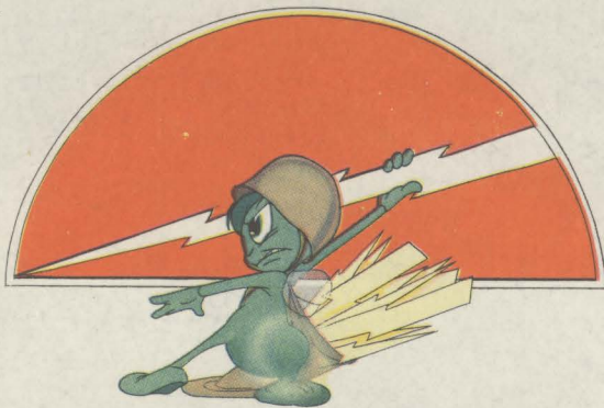
78TH DIVISION. CAMP BUTNER. N. C.