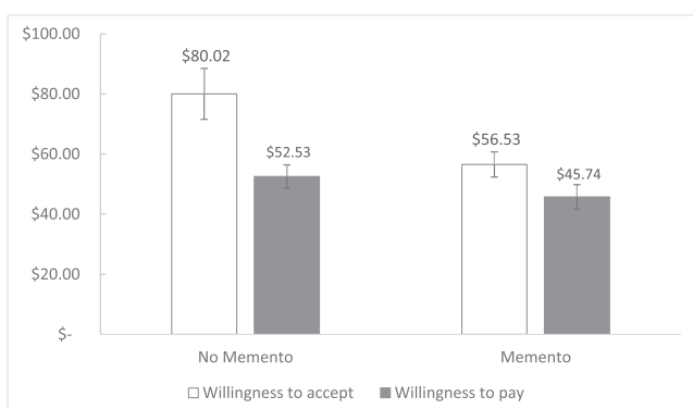
FIGURE 1 Willingness to accept and willingness to pay for those with and without mementos. Note: Error bars represent standard errors.

Participants were recruited to participate in the study through Amazon Mechanical Turk ( N = 950 , gender: 45% male, age: Mdn = 37 ) and were randomly assigned to one of five conditions. The first set of three conditions was designed to examine the effect of a memento when it is a segregated gain (gain conditions), while the second set of two conditions was designed to examine the effect of a memento when it is a retained part of the original endowment (retain conditions). The endowed item was a boxed CD set of one's favorite band's music, while the memento was a 4-inch \times 6-inch photo featuring the cover of the boxed CD set.