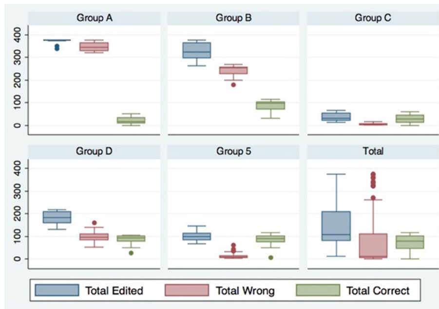
FIGURE 1 | K mean cluster analysis.