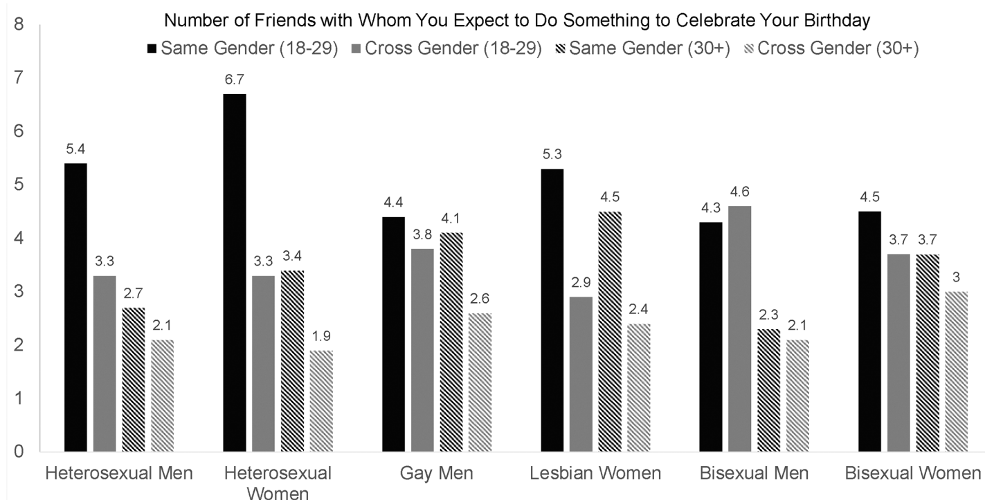
Fig 3. Differences in the Number of Same-Sex and Cross-Sex Friends with Whom Participants Can Expect to Celebrate Their Birthday for Sexual Orientation Groups.