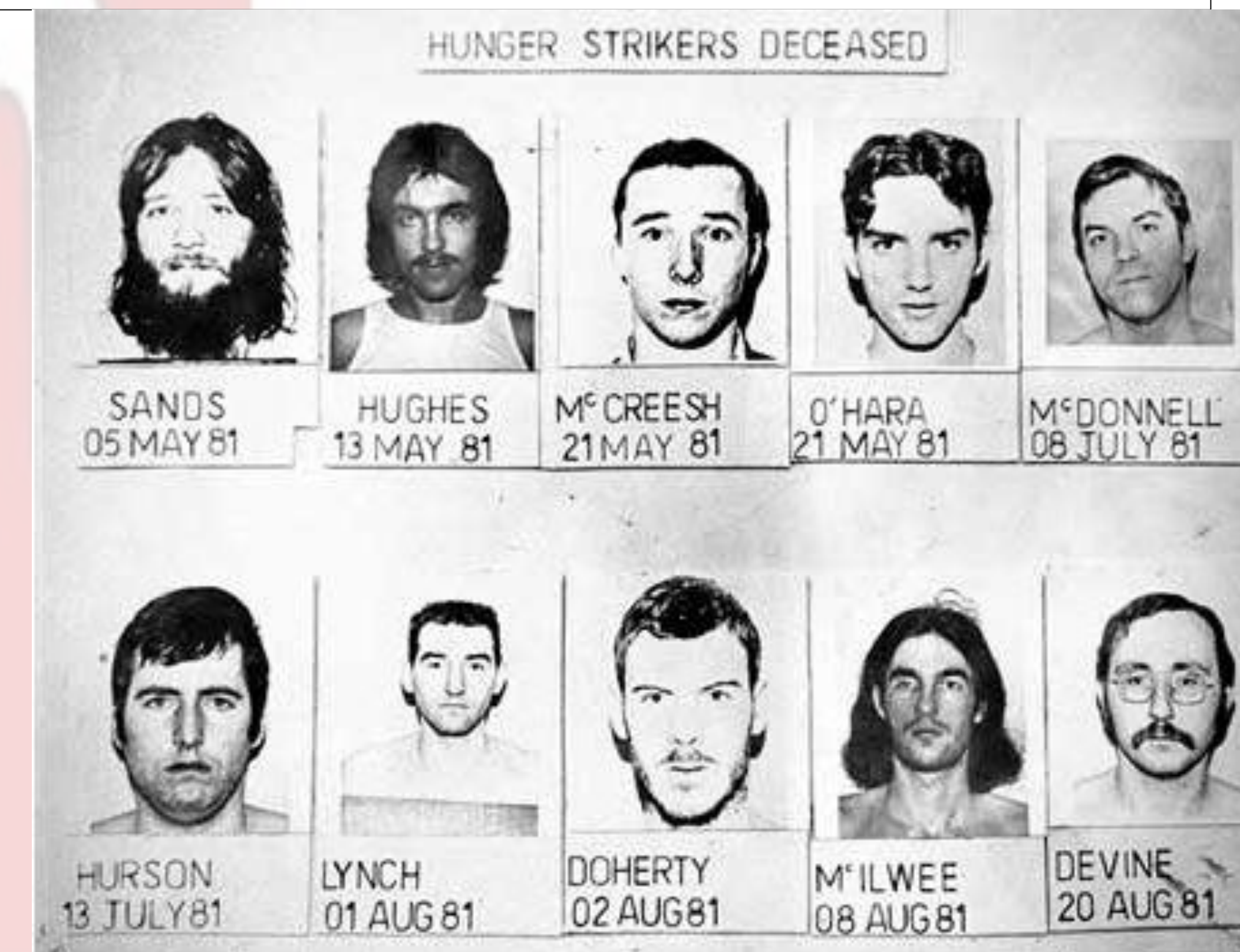
Names and pictures of the men who died during the Hunger Strike