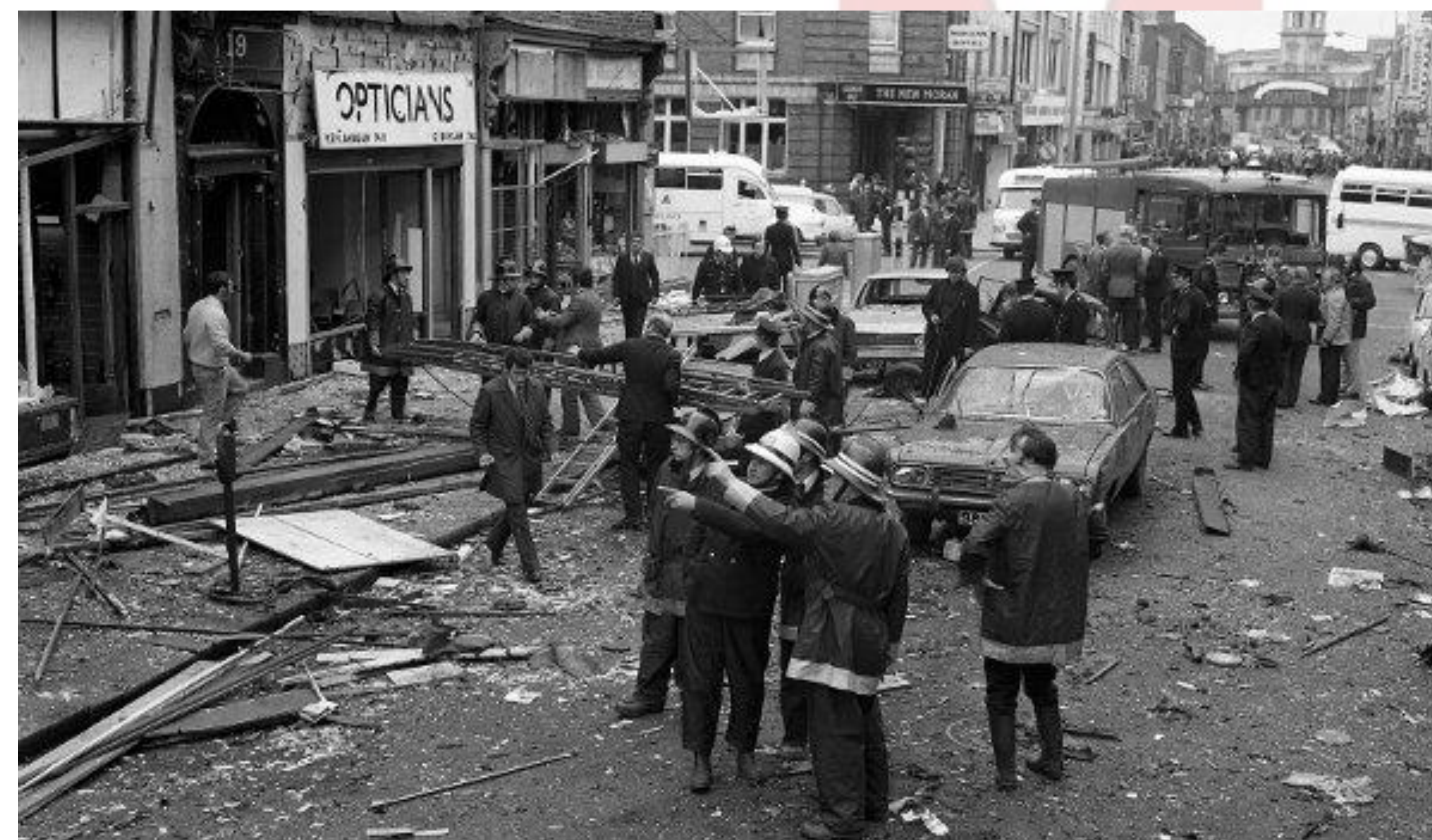
Aftermath of a bombing in Belfast