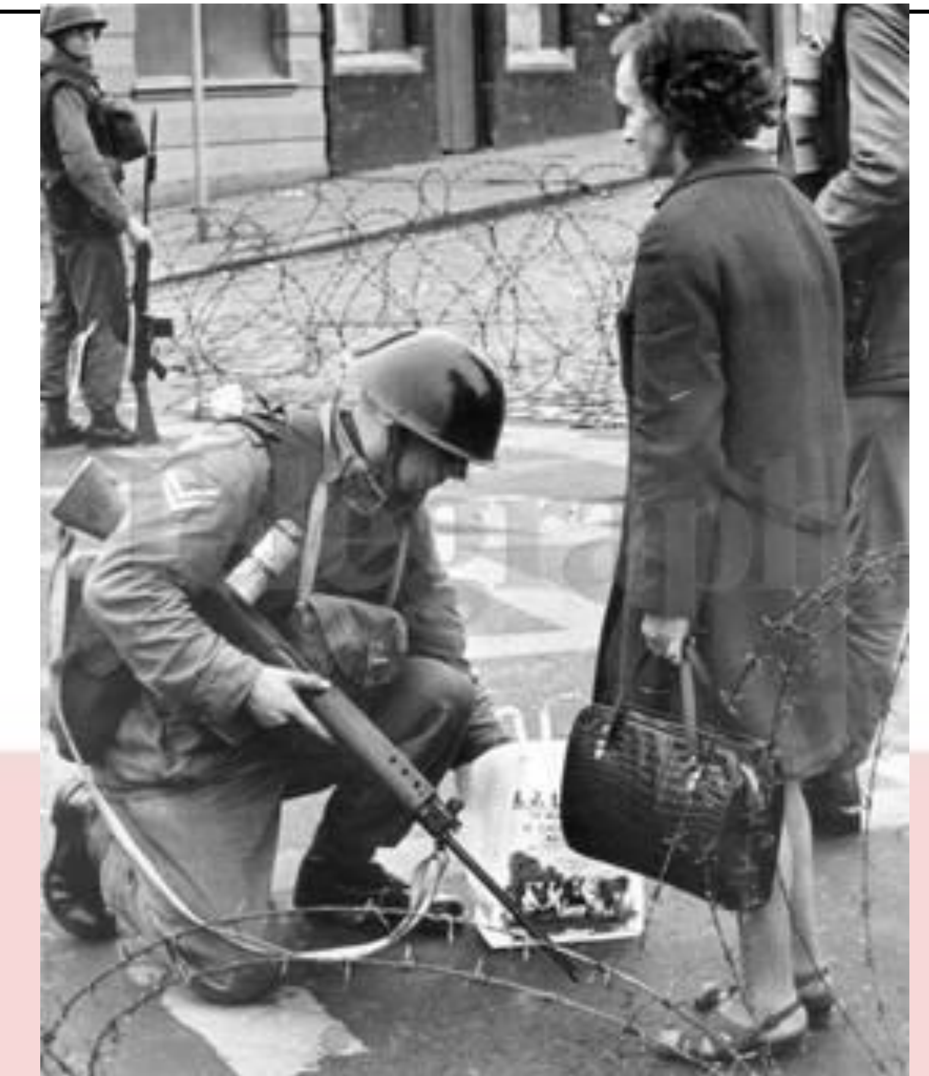
Woman at Checkpoint in Belfast