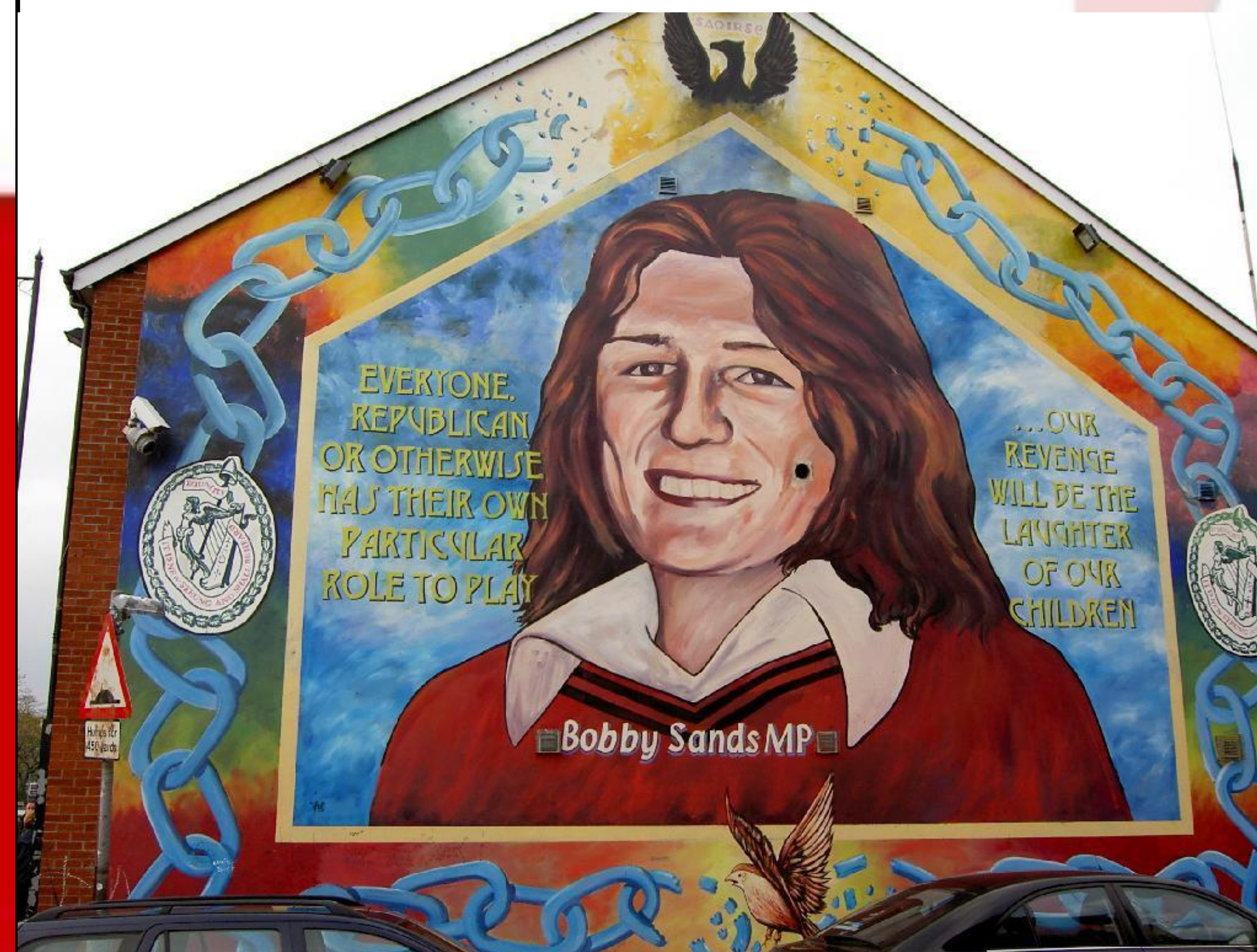
Mural of Bobby Sands in Belfast

I will go about researching the newspapers in order to find the divides in communities using Bobby Sands as the focal point due to the polarization that he caused. Using Foucault and his theories on Discipline, Power, and Panopticism as well as Retamar and his theories regarding Hybridity.