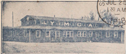
A RED TRIANGLE CLUB—IN CAMP