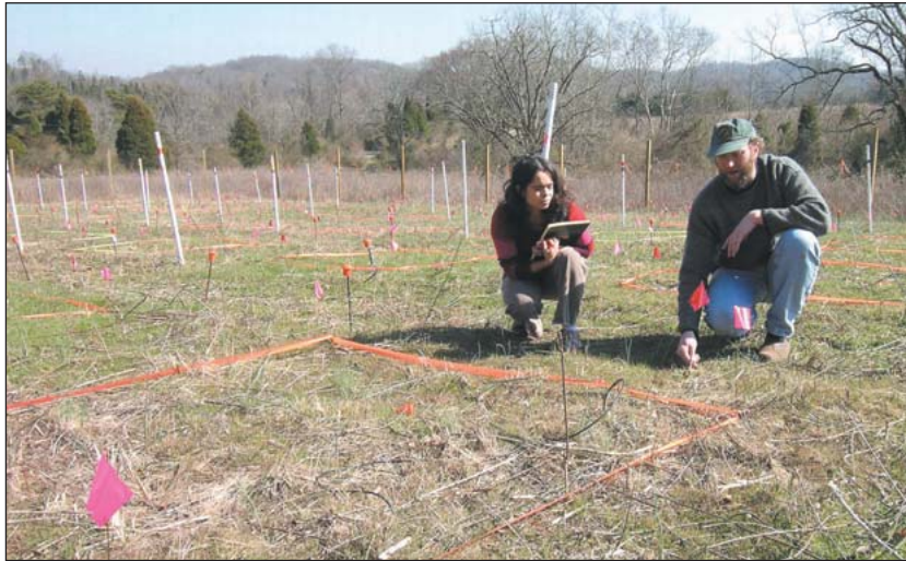
Figure 2. Intellectual contribution in ecology can be difficult to quantify because field technicians or undergraduate students may provide important, informal observations that can easily be under-acknowledged by principal investigators. The informal contributions may drive future research, direct data analyses, and contribute to manuscripts. Communication among potential contributors before, during, and after a project is critical to ensure assignment and acceptance of responsibility. Each contributor is responsible for drafting his or her own byline; the guarantor is responsible for evaluating each byline relative to the others, and for maintaining internal consistency.

willing to be held accountable for its contents and not be just responsible for a portion of the work involved. In contrast, an acknowledgee may contribute formal or informal ideas to ongoing projects, collect enormous amounts of data, and develop and/or conduct statistical analyses, but may not be accountable for the final contents of all or even portions of the final manuscript. Open communication about the roles, responsibilities, and expectations for authors as opposed to acknowledgees should be ongoing during the writing process.