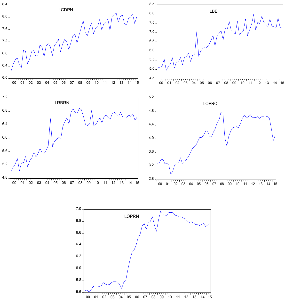
1: Time profile of the logs of variables

To reveal the direction of causality towards budget expenditures, we also run the following regression: