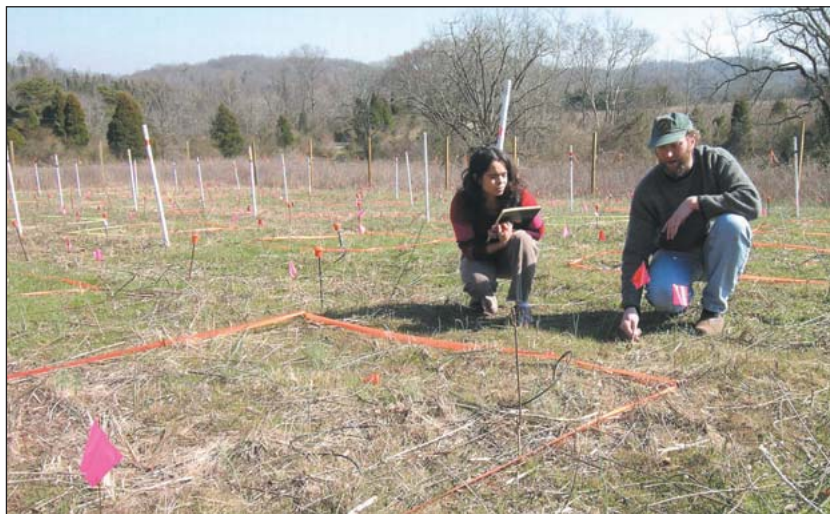
Figure 2. Intellectual contribution in ecology can be difficult to quantify because field technicians or undergraduate students may provide important, informal observations that can easily be under-acknowledged by principal investigators. The informal contributions may drive future research, direct data analyses, and contribute to manuscripts. Communication among potential contributors before, during, and after a project is critical to ensure assignment and acceptance of responsibility. Each contributor is responsible for drafting his or her own byline; the guarantor is responsible for evaluating each byline relative to the others, and for maintaining internal consistency.

willing to be held accountable for its contents and not be just responsible for a portion of the work involved. In contrast, an acknowledgee may contribute formal or informal ideas to ongoing projects, collect enormous amounts of data, and develop and/or conduct statistical analyses, but may not be accountable for the final contents of all or even portions of the final manuscript. Open communication about the roles, responsibilities, and expectations for authors as opposed to acknowledgees should be ongoing during the writing process.