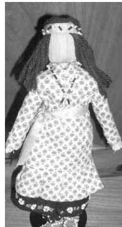
Mid. 20th Century Corn Husk Doll

the colony of Pennsylvania, admired the system developed by the Indians, and encouraged the colonists to look to the Iroquois Confederacy as a model of government.