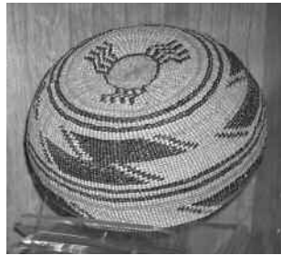
Early 20th Century Woman's Cap