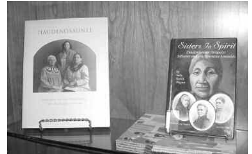
Books in the display discuss the heritage of Haudenosaunee women

The Iroquois Confederacy, a group of approximately 20,000 in 1600, had power disproportionate to their relatively small numbers. Their political influence affected native tribes from