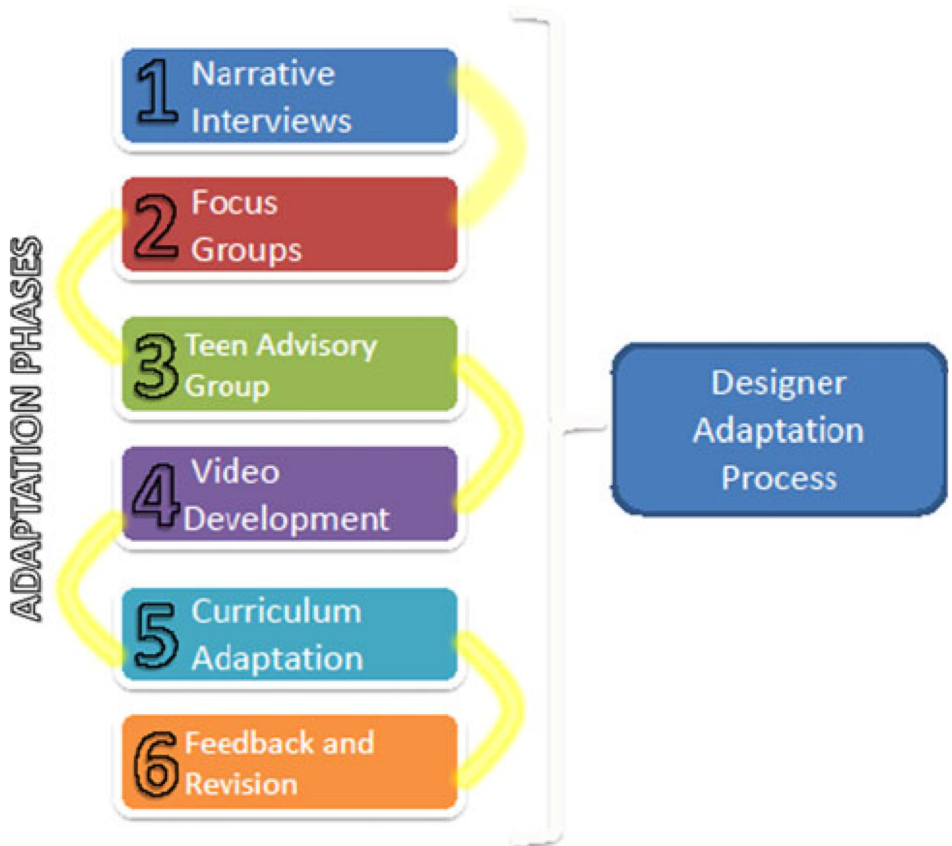
Fig. 1. Designer adaptation process. Note: All six phases of the designer adaptation process were linked in an iterative and reflexive process. As new information was gathered, it was integrated into the curriculum so that “rural voices” were infused into the regrounded curriculum