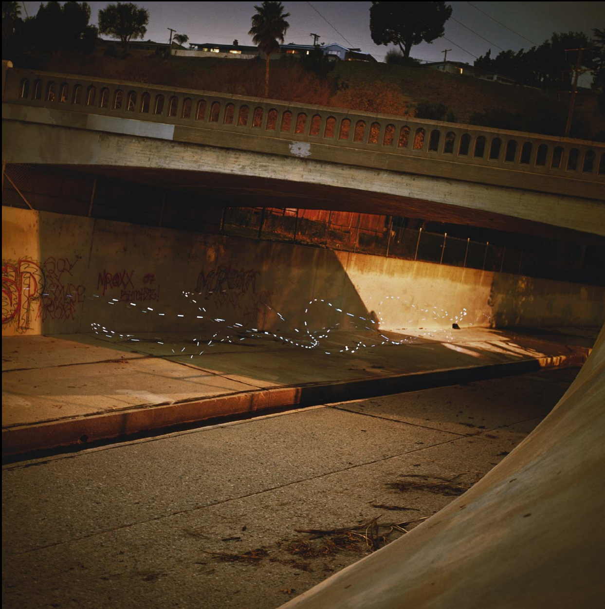
Dark Skate Los Angeles / Broken Line, 2007 c-print 12 x 12 inches