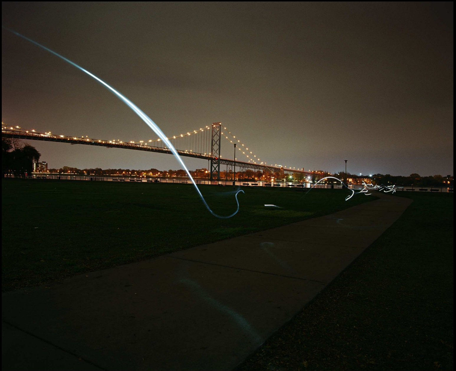
Dark Skate Detroit / Bridge to Canada, 2010 c-print 48 x 56 inches