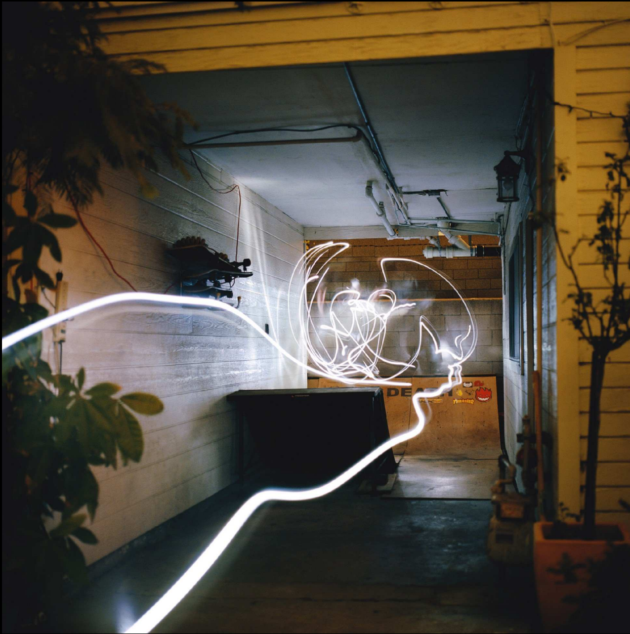
Dark Skate Los Angeles / Backyard, 2007 c-print 48 x 48 inches