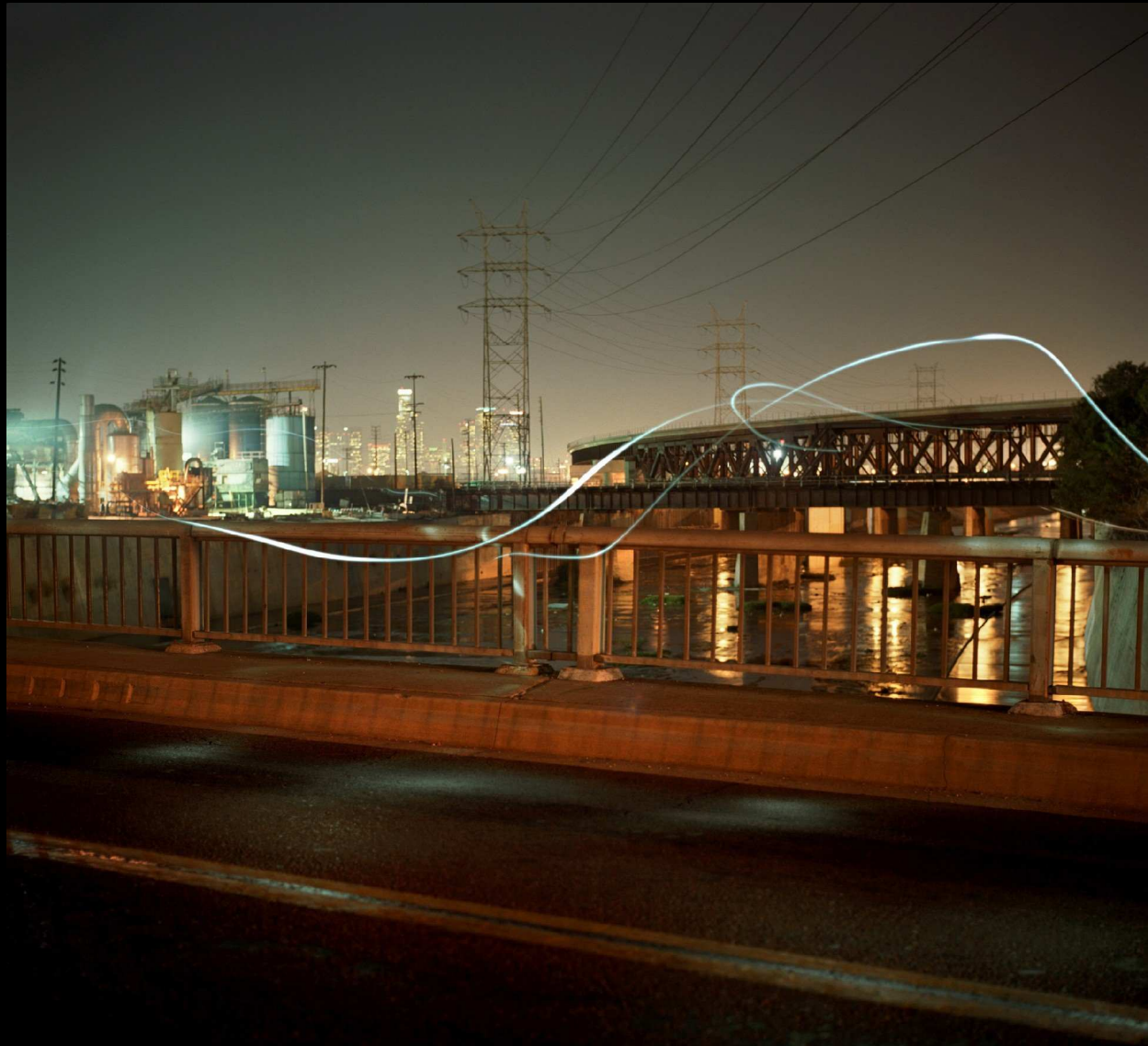
Dark Skate Los Angeles / Downtown, 2007 c-print 48 x 48 inches